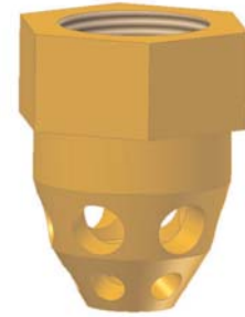
Fike Discharge Nozzle

ProInert Discharge Nozzles are available in sizes of 15, 20, 25, and 40 mm, which correspond to the distribution pipe threads feeding the nozzle. Each nozzle has 12 orifices and provides a 360-degree discharge pattern. Nozzle orifices come in standard size. The nozzle is equipped with a customized orifice plate to provide accurate inert gas flow results. The Fike ProInert Flow Calculation Program specifies the required orifice plate. The orifice size is stamped on the nozzle body.